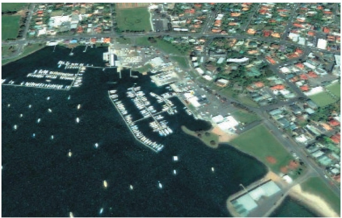
Royal Yacht Club of Tasmania